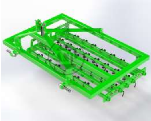
Organic weeder GADER GR B