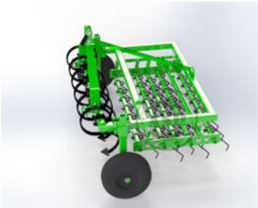
Organic weeder GADER GR B GR +