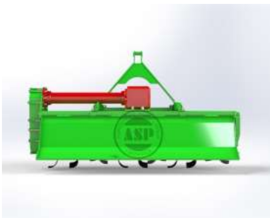
Rotary tiller RT